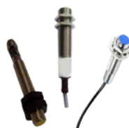
Sensor (Application Specific)