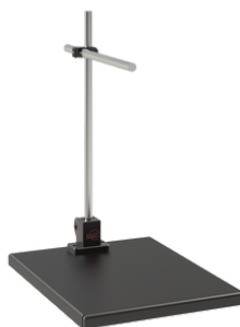
Pinch Valve Stand