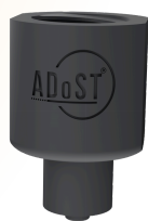
ADoST nozzle adaptor